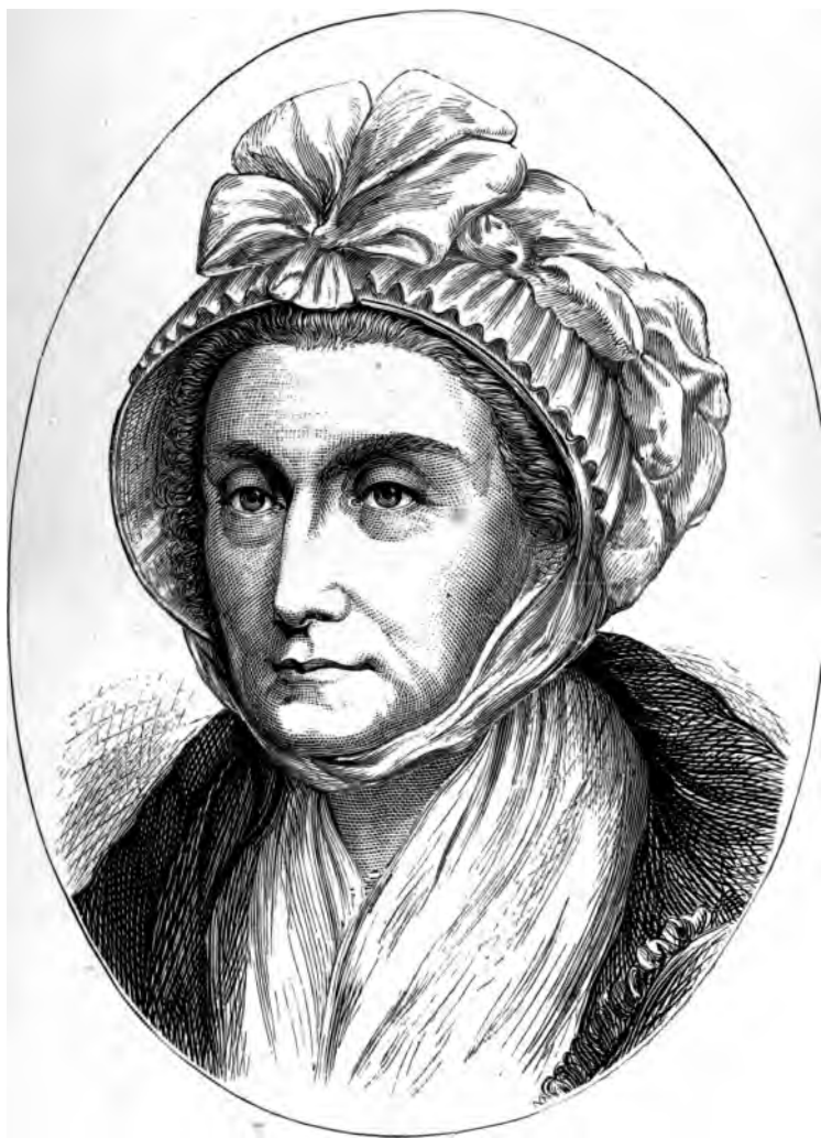
COUNTESS OF HUNTINGDON.